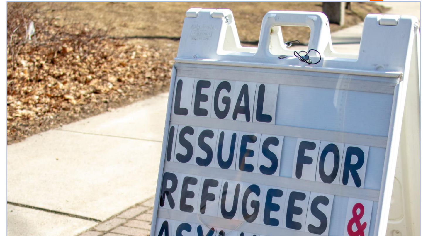
VECINA Immigration Legal Services Community of Practice